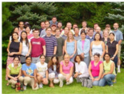
2004 CIMD Research Retreat and Picnic

Center for Immunology and Microbial Disease Albany Medical College 47 New Scotland Ave., MC-151 Albany, NY 12208-3479